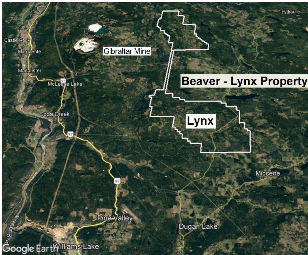
Figure 2: The Beaver-Lynx nickel-cobalt project is located in the Cariboo Region of south-central British Columbia.