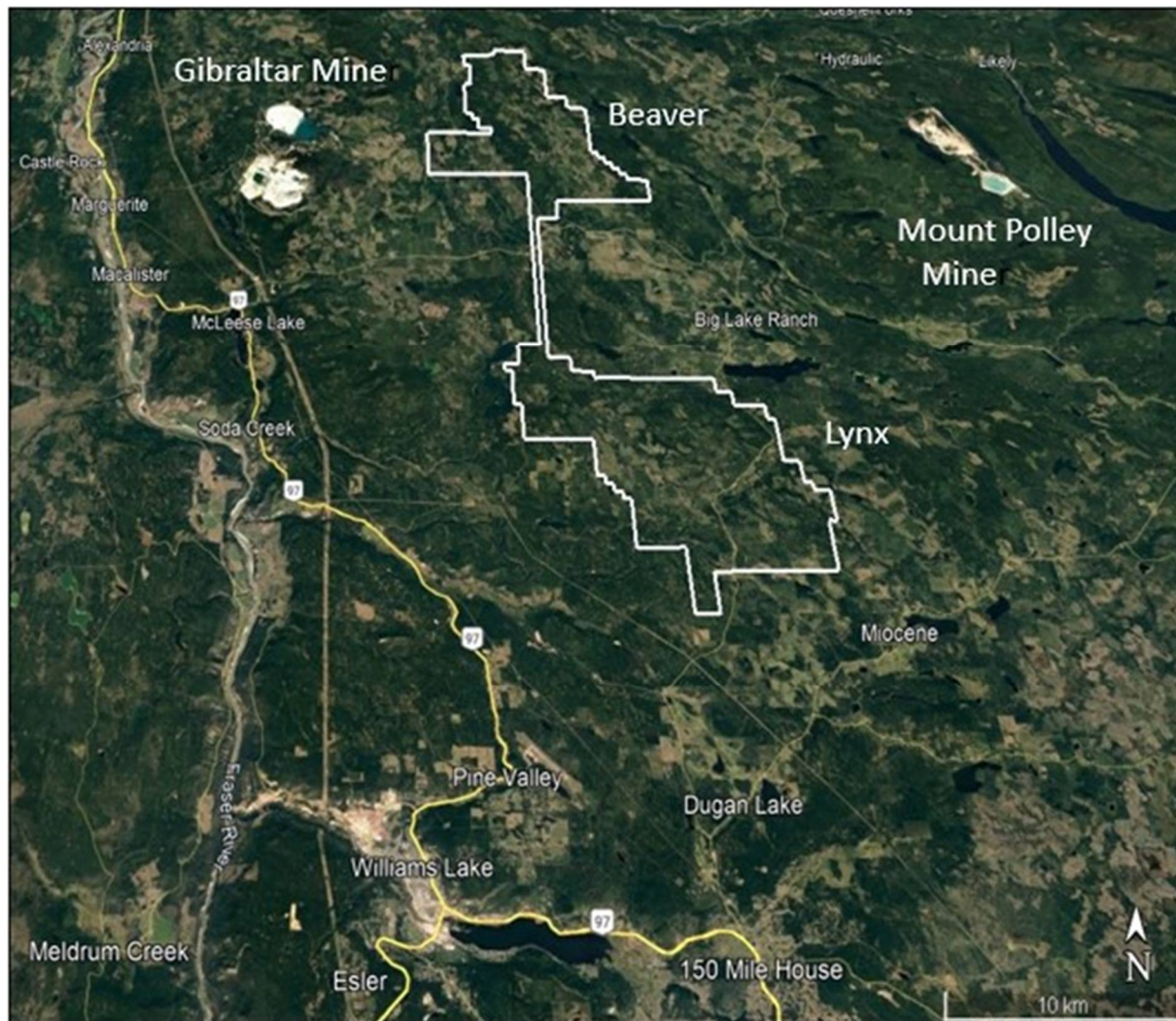
Google Earth satellite image of Beaver-Lynx property between Gibraltar and Mount Polley mines, two of the largest mining operations in British Columbia. Beaver is the northern property area connected to southern Lynx block. The project has excellent infrastructure nearby including roads, railway, and hydropower. The surrounding resource communities offer comprehensive services and a skilled work force.